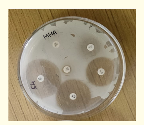
Figure 1: Antibiotic Sensitivity Testing (AST) against pus s ample collected from abscess.

firmed infection with Staphylococcus aureus. AST revealed that the bacterial culture was highly sensitive to Cephalexin, Penicillin, Enrofloxacin while it was totally resistant to Oxytetracycline and Erythromycin (Figure 1).