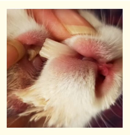
Figure 3: Preparation of aseptic surgical site. Swelling near to right lower incisors (Case 2).