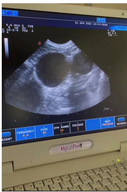
Figure 3: Multiple anechoic fluid filled sacs.