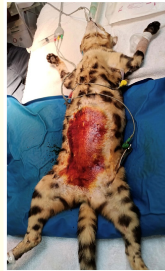
Figure 4: Queen on dorsal recumbent position.