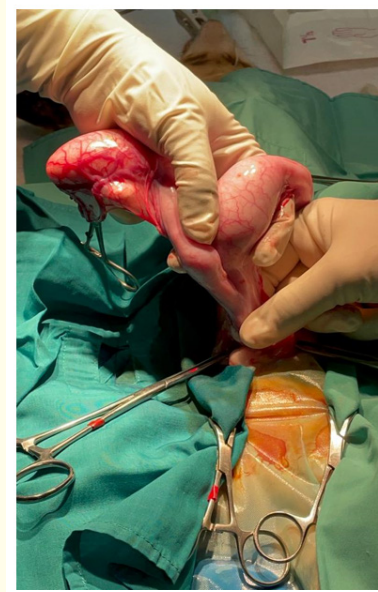
Figure 5: Uterus after exteriorization.