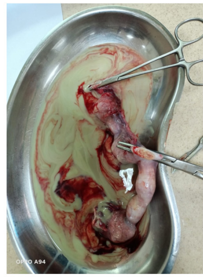
Figure 6: Removed Uterus with Pus.