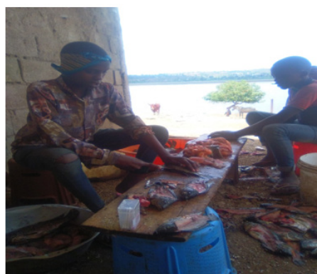
Figure 4: Fish Processor.