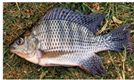
Figure 2: Nile Tilapia ( Oreochromis niloticus ).

The study was conducted on fish harvested from Haramaya Lake. In Lake Haramaya Commercially important species Nile tilapia ( Oreochromis niloticus ) and African catfish ( Clarias gariepinus ) were found. Nile tilapia constitutes about 90% of the total production, while African catfish contribute only about 7-8%. However, the contribution of catfish rises to 20% of the total landing during the fasting periods of the Ethiopia Orthodox Tewahido Church followers [29].