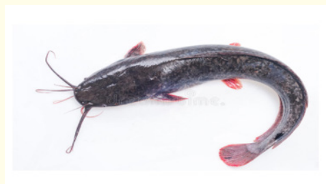
Figure 3: African Catfish ( Clarias gariepinus ).