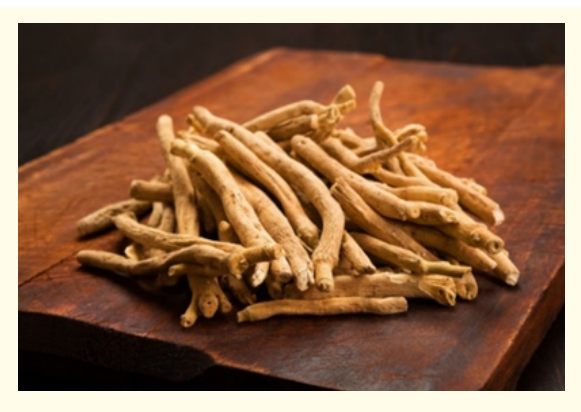
Figure 2: Roots of Ashwagandha.