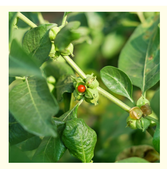
Figure 1: Aerial parts of Ashwagandha.

the vegetative stems. The plant produces small, bisexual, pale green flowers with five petals and five sepals, grouped in axillary cymes, along with a bicarpellary ovary. As the flowers mature, they develop into small berries, about 5 mm in diameter, which start off green and turn orange-red upon ripening, containing numerous tiny, yellow, reniform seeds [Figure 1]. Ashwagandha thrives in the arid, dry soils of India and other subtropical regions of Asia and Africa. Primarily tetraploid with 2n = 48 chromosomes, the plant also exhibits variations in ploidy and has tuberous roots that contribute to its medicinal properties [16,17,19,20] [Figure 2].