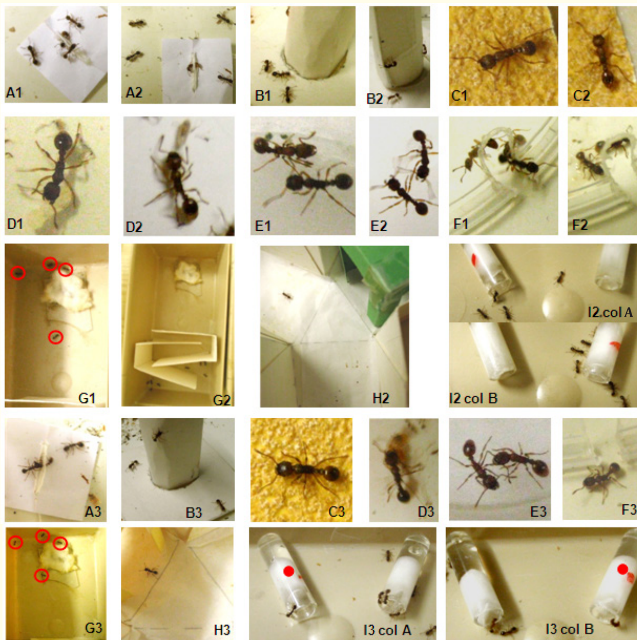
Figure 2: Ants under 1: normal diet, 2: Sativex diet, 3: ethanol diet. A: ants moving towards a tied nestmate, and doing so poorly when under Sativex diet. B: ants coming onto an unknown risky apparatus. C: ants walking on a rough substrate, with difficulty when under normal diet and frankly, less perceiving the uncomfortable character of the substrate, when under Sativex diet. D: an ant taking care of a larva when under a normal diet, but not when consuming Sativex. E: two nestmates staying aside one another, quietly when not consuming Sativex and aggressively (opening their mandibles) when consuming this medicine. F: ants in an enclosure provided with a notch: under normal diet, they succeeded in escaping; under Sativex consumption, they failed to do so. G: four ants under normal diet and no one under Sativex diet having reached the area lying beyond a difficult path. H2: an ant under Sativex diet trained to a hollow green cube giving the wrong response when tested in a Y-apparatus having such a cube in one of its branch. I2: ants under Sativex diet choosing the tube (with a red dot) containing the drug, presenting thus a dependence on this medicine. A3, B3, C3, D3, E3, F3, G3, H3: ants under ethanol diet (the photos show successively: orientation, audacity, tactile (pain) perception, brood caring, aggressiveness against nestmates, escaping ability, cognition, conditioning ability) presenting no behavioral difference in comparison with ants living under normal diet, except some slight decrease of tactile perception (C3). I3: ants presenting no dependence on ethanol (red point) consumption.