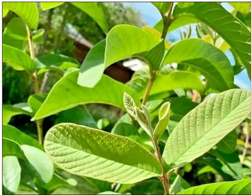
Figure 1: Psidium guajava L.

Scientific investigations since the 1940s validate guava’s medicinal properties, with in vitro , in vivo , and clinical trials demonstrating efficacy against infectious diseases (diarrhea, dental caries) and noncommunicable conditions (diabetes, hypertension). Phenolic compounds in leaves exhibit anti-inflammatory, antimicrobial, and antidiabetic effects, while fruit extracts show antioxidant and anticancer potential. Commercial applications include guava tea and supplements.