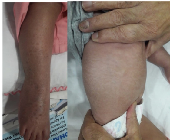
Figure 2: A, B: Dry skin, Ichthyosis.

no social smile achieved. She was only 3.8kg at 11 months of age, 54cms long and a head circumference of 39cms. All parameters were below the 3 rd centile for age. Apart from the afore-mentioned findings, a complete general examination revealed small palpebral fissures, short limbs, posteriorly placed dysplastic pinnae, ape thumb deformity, dry scaly skin and ichthyosis (Figure 2A, B). She had generalised hypotonia, power was normal. On enquiry it was found that the parents feel the baby's facial and other physical features resembles the mother's sister's daughter, who expired in infancy due to breathing difficulties. Xray spine showed hemivertebrae of the cervical and thoracic vertebrae with only 11 pairs of ribs. Butterfly vertebra was noticed at D12 level. A kypho-scoliotic deformity was also noticed in the lower dorsal and upper lumbar region (Figure 4A, B). In view of above findings, a whole exome sequencing was sent. This revealed a homozygous c.1043C > T (p.A348V) likely pathogenic variant in the SUMF1 gene, suggestive of an autosomal recessive condition, Multiple Sulfatase Deficiency (MSD). The child was hence diagnosed with neonatal type MSD. Parents were counselled regarding further evaluation of the child with respect to cardiac, neurological, hearing abnormalities; poor prognosis and future family planning.