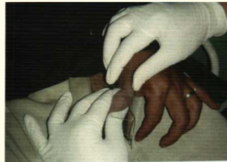
Figure 1: Collection of specimens for gram stain and wet [12].

This technique is a faster laboratory test to evaluate urethritis and determine the presence or absence of gonococcal infection. Considered positive for NGU if there are more than 4 leukocytes with 1000 times magnification, but unable to see BE and BR [11].