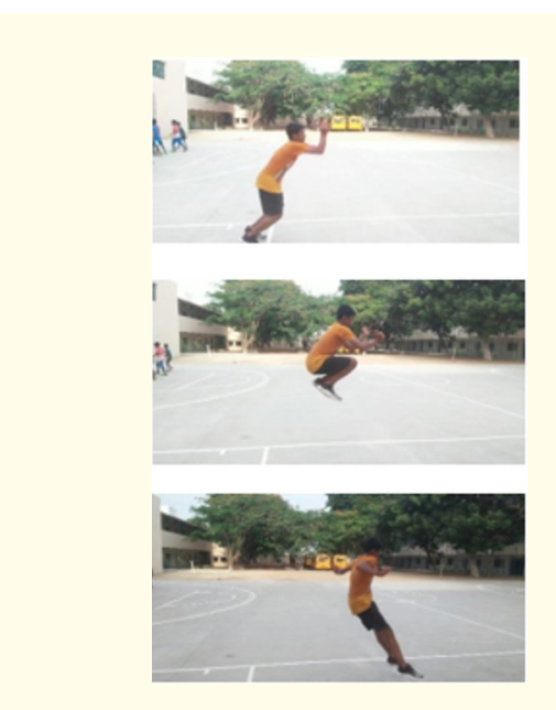
Figure 5: Double leg speed hop