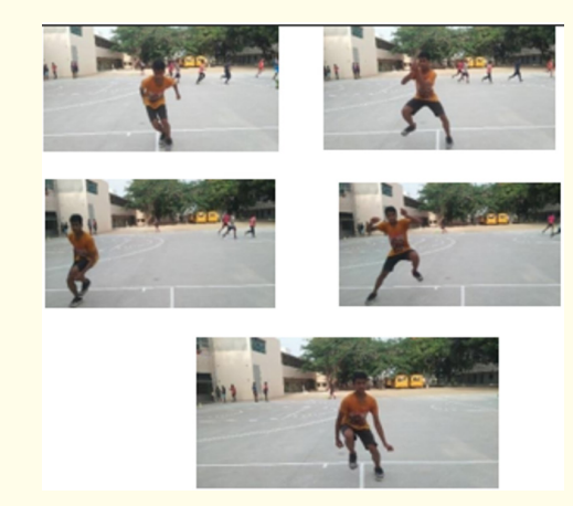
Figure 4: Lateral Bound.