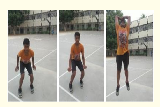
Figure 2: Rocket Jump.

fects of lower body plyometrics and stretching on vertical jump in female collegiate volleyball players and concluded dynamic stretching along with plyometric exercises can be more advantageous training program for a better vertical jump performance in female college student volleyball athletes [5,9,10]. Hence the hypothesis was rejected.