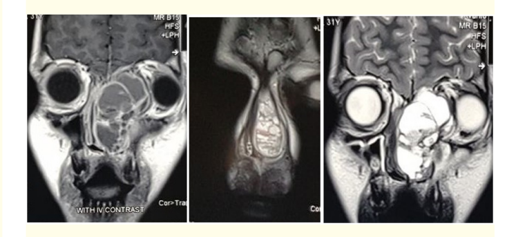
Figure 2: Coronal T2-weighted and contrast enhanced T1-weighted MR image from skull base show an expansile multiseptated cystic mass with fluid-fluid level in T2 and septal enhancement in post contrast image.

The patient operated with endoscopic assisted Denker approach and the whole mass was resected macroscopically. During the surgery, the pathology was mainly in the right nasal cavity,