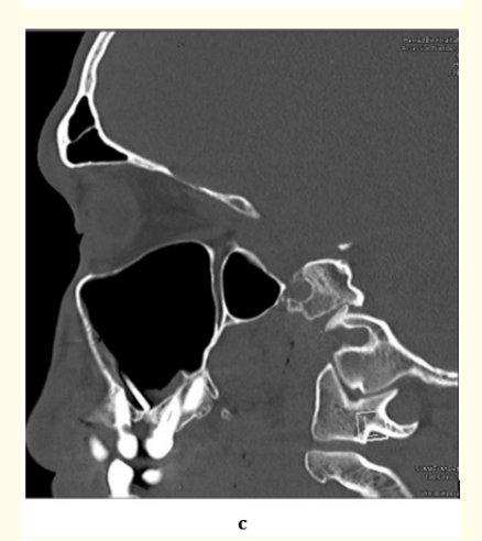
Figure 2a-c: Shows 3 sagittal cuts of CT sinus showing the head of the foreign body pointing Anteriorly, most likely due to the change in position during the MRI.