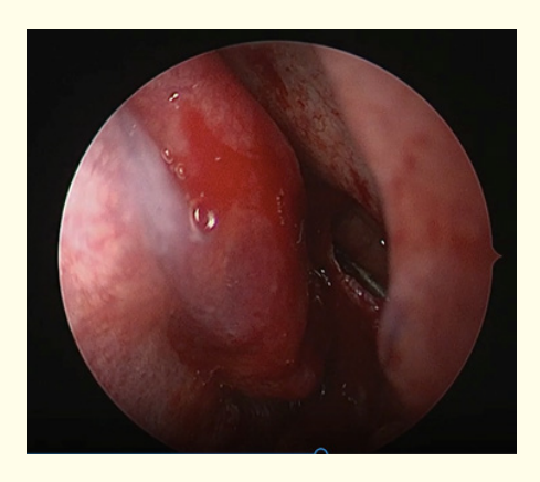
Figure 3a: Endoscopic view showing radio opaque foreign body in maxillary sinus.