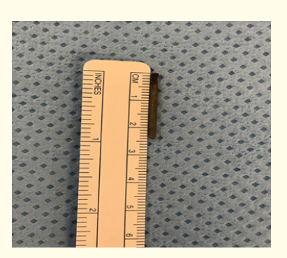
Figure 3b: Shows the foreign body post removal.