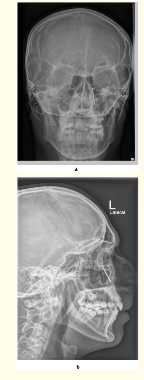
Figure 1a and b: Shows the Anterioposterior and Lateral view Xray showing the radioopaque foreign body situated in the left maxillary sinus with head of the foreign body pointing posteriorly.

The maxillary sinus anatomy and its relation to the roots of maxillary molars, premolars and canines, is in a way that many of the odontogenic infections and procedures can cause complications in the sinus. In addition, a thin floor of the maxillary sinus can lead to projection of the roots of posterior teeth's in some individuals [8]. In this case report, a dental bur was most likely introduced