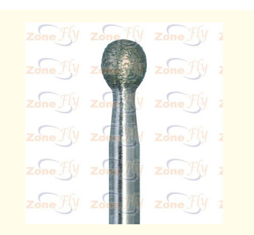
Figure 3c: Shows an image of a dental bur size 801.

during the dental procedure. However, a medical practitioner must always suspect the possibility of foreign body in the maxillary sinus in a patient complaining of recurrent unilateral facial pain even if no history of dental procedure is elicited. In this case, an MRI was done in the patient, this could have caused fatal complication due to the foreign body being dislodged to the brain or other vital structures.