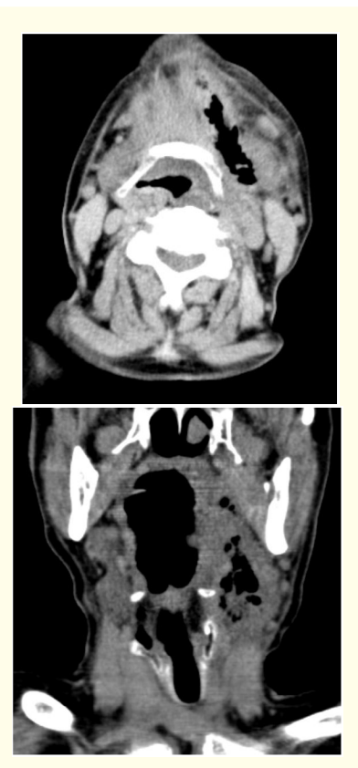
Figure 1 and 2: High-resolution computed tomographic scans of neck showing large gaseous area along the fascial planes of the left anterior lateral region of the neck.

Seven days after treatment the inflammation indexes had normalized (WBC 10,6 10^3/ \mu L, NE% 75,3, VES 5 mm, PCR 0,14 mg/dl). Ten days after treatment a neck CT scan with c.m. was performed and it showed gas resorption (Figure 3). We proceeded to the administration of oral antibiotics. The patient was discharged without complications 17 days after admission.