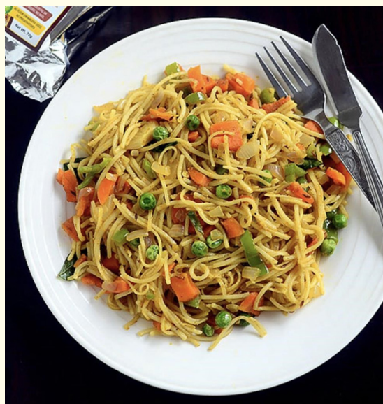
Figure 3: Cooked millet noodles.

Millet noodles can be cooked in a similar way to traditional wheat noodles. Simply bring a pot of water to a boil, add the millet noodles, and cook for 8-10 minutes, or until they are tender. Millet noodles can be served with a variety of sauces and toppings, such as stir-fried vegetables, peanut sauce, or a simple tomato sauce.