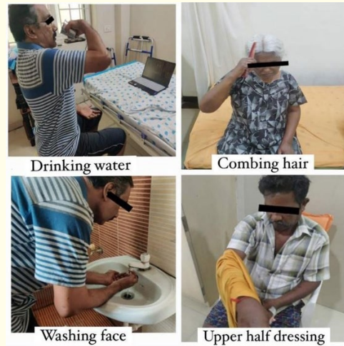
Figure 1: Activities for Experimental group patients with Hemiparesis.

In this study, patients who had experienced a hemiparetic stroke and met the inclusion criteria were assigned to either the