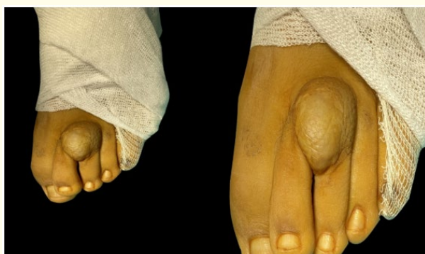
Figure 1: Clinical Image of tumor on the dorsal aspect of the left forefoot in the metatarsophalangeal region.

X-rays showed no evidence of blastic or osteolytic lesions in the forefoot. Magnetic resonance imaging showed an isointense subcutaneous mass that did not affect the joint or the bone tissue (figure 2 A, B, C and Figure 3 A, B, C).