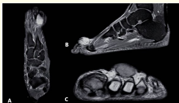
Figure 3: This hyperintense appearance on T2 suggests the presence of a component with a high concentration of water, such as the myxoid stroma or the cartilaginous component present in the tumor.

We decided to take the patient to the operation room for tumor excision. The patient was placed in a supine position under regional anesthesia and a straight incision was made over the lesion in the dorsal region, with wide skin margins. A well-circumscribed mass with no signs of invasion of adjacent structures was identified, measuring 2.0 × 3.0 × 1.2 cm. Complete resection with safety margins was performed. The specimen was sent to anatomical pathology in formalin. Wound closure was performed with vycril 3.0 and nylon 4.0 and a sterile dressing was applied (Figure 4 A, B, C and D).