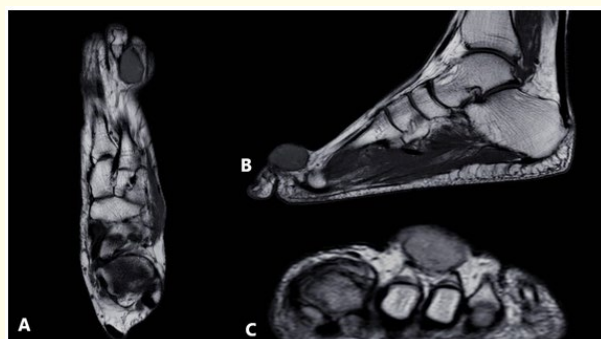
Figure 2: RNM image in T1, a well-defined mass is usually seen and isointense compared to the surrounding tissue. The isointense appearance on T1 suggests a proton density like that of the surrounding muscle tissues.

X-rays showed no evidence of blastic or osteolytic lesions in the forefoot. Magnetic resonance imaging showed an isointense subcutaneous mass that did not affect the joint or the bone tissue (figure 2 A, B, C and Figure 3 A, B, C).