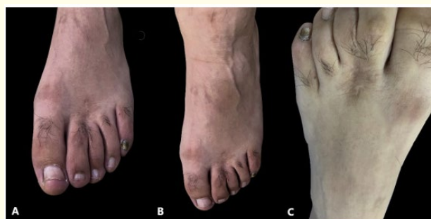
Figure 5: Image clinical after Follow up 24 months.

The patient started weight bearing with a Walker boot immediately after the operation. The stitches were removed after 3 weeks. The patient continued to live an everyday, pain-free life with a postoperative follow-up of 24 months. He returned to all activities of daily life without restrictions (Figure 5 A, B, C).