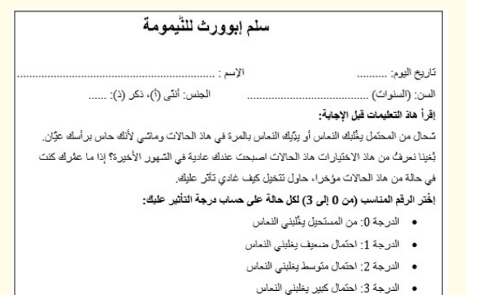
Figure 2: First part of ESSm version translating instructions of English version of ESS in Arabic (Moroccan dialect).

من المهم أتك تجاوب على كل سؤال بالتدقيق: