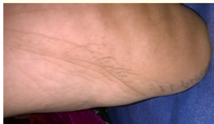
Figure 4: Crackles at the sole and heel of the foot.