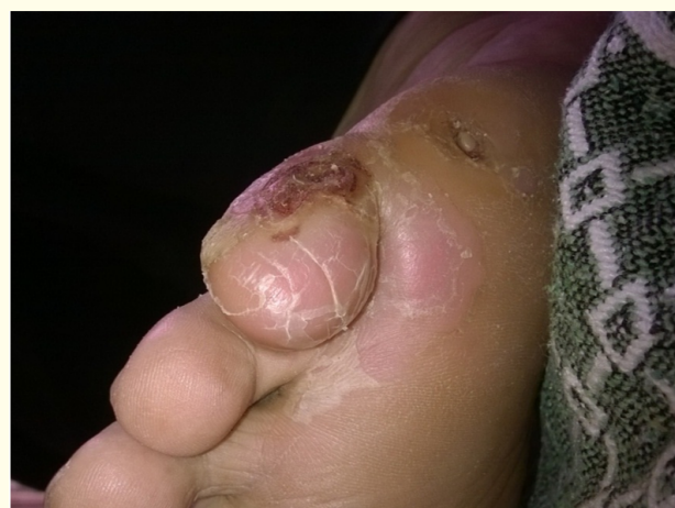
Figure 2: ulcer at the fifth toe.

and 12 (16.9%) symptomized patients had critical limb ischemia. This difference was statistically significant. According to intima media thickness: there were 2 (20.0%) non symptomized patients with normal intima media thickness, while 2 (20.0%) non symptomized patients with decreased intima media thickness, whereas 6 (60.0%) non symptomized patients with increased intima media thickness, while there were 3 (4.2%) symptomized patients with normal intima media thickness, whereas 1 (1.4%) symptomized patients with decreased intima media thickness, while 67 (94.4%) symptomized patients with increased intima media thickness. This difference was statistically significant as shown in table 7.