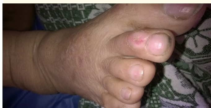
Figure 3: Claw toes and healed ulcer at the top of the second toe.