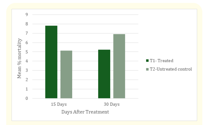
Figure 1: Efficacy of Ami Meta Star against groundnut infestations by white grubs.

The treatment group saw a death rate of 5.23% at 30 days after treatment (DAT), while the untreated control group observed a mortality rate of 6.91% demonstrate in Figure 1. This indicates a 24.3% decrease in the mortality rate of white grubs due to Ami Meta Star treatment mentioned in Table 2. In other studies, at 30 days post-treatment (30 DAT), the talc-based treatment for Metarhizium anisopliae produced a 7.36% clump death rate [31]. On other hands at 30 DAT, an average of 7.88 white grubs per meter row were produced by the 1x10<sup>9</sup> concentration of M. anisopliae treatment [32].