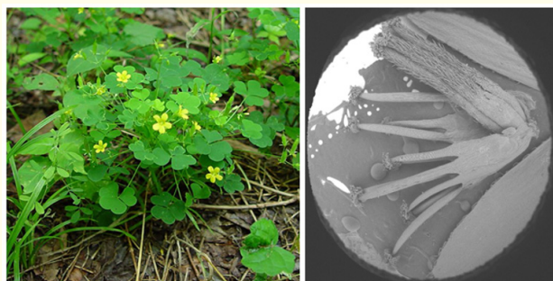
(a): Oxalis stricta - Habitat