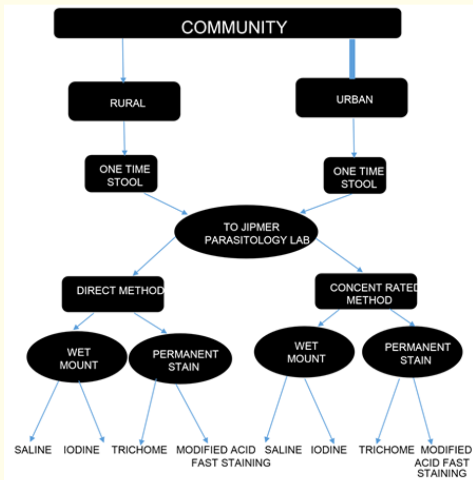
Figure 1: Flowchart of the stool sample processing.

This cross sectional prospective study was done in Puducherry for a period of 4 months (May – August) in 2018. Any stool samples of adult/ pediatrics participant in the community with or without diarrhea and who are willing to participate were enrolled during this period. The entire freshly collected stool from the community were taken to the Parasitology laboratory of the Microbiology Department and processed within two hours. The workflow of the processing is shown in figure 1.