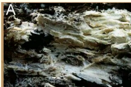
Figure 2: Phanerochaete chrysosporium degrades lignin, leaving the white cellulose untouched.