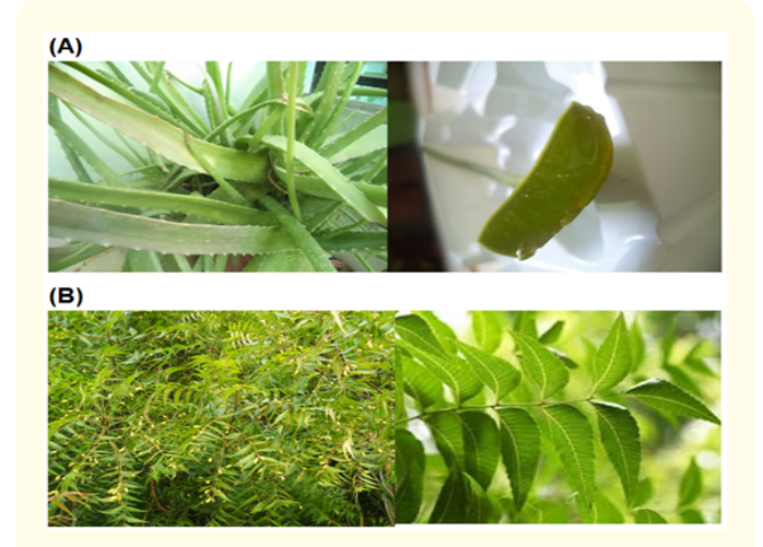
Figure 1: (A) Aloe barbadensis (Miller) plant and its leaf sample. (B) Azadirachta indica (Neem) tree and its leaves.

Plants were identified and collected from various areas of Dungarpur district of Rajasthan, India, after proper verification by ayurvedic medical professional. Aloe vera barbadensis species was selected for this study (Figure 1A). Aloe vera barbadensis can grow up to 100 cm high although mostly to 30 to 60 cm and it has thick leaves in rosette pattern. The parenchyma cells of the leaves contain large quantities of pulp. The fleshy leaves with serrated edges that arise from a central base and grow to nearly 30 - 50 cm long. Aloe vera (Aloe barbadensis Miller) is a perennial plant of liliacea family with turgid green leaves joined at the stem in a rosette pattern. Aloe vera leaves are formed by a thick epidermis (skin) covered with cuticle surrounding the mesophyll, which can be differentiated into chlorenchyma cells and thinner walled cells forming the parenchyma (fillet). The parenchyma cells contain a transparent mucilaginous jelly which is referred to as Aloe vera gel. Aloe vera leaves are normally sensitive to subfreezing temperature. Azadirachta indica (Figure 1B) was also identified and collected after the proper verification by botanist from the same place described above.