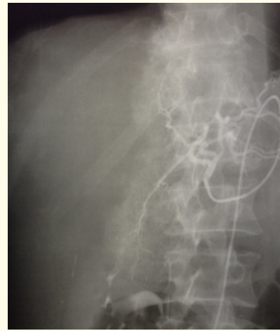
Figure 1: Dynamics of the content of dendritic cells of the central zone of the classical lobules.

Next, it was performed intra-arterial infusion of cytostatics at an infusion rate of 1000-1200ml/hour using the Infusomat device (Braun FM-5, Germany). The total infusion time did not exceed 3-4 hours. After the procedure, the catheter is removed, the femoral