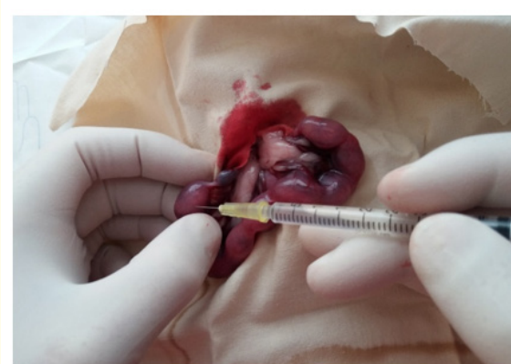
Figure 1: The method of antenatal antigen administration.

All animals were conditionally divided into 3 groups: Group I - 48 intact animals, which were born from healthy rats without any antigen administration during pregnancy; Group II - 48 control animals, which were exposed to antenatal intrafetal administration of 0.05 ml saline solution on the 18 th day of prenatal development (Figure 1). Group III - 48 experimental animals, which were exposed to antenatal antigen administration at 18 th day of prenatal development by analogy with the control group (Figure 1). Staphylococcal purified liquid toxoid (10-14 units in 1 mL, diluted 10 times) in volume of 0.05 mL was chosen as the antigen. The dose of toxoid was determined by using the formula for recalculating the therapeutic dose for human per rat. Optimal dose of the toxoid was experimentally derived with consideration to the weight of the animal. So toxoid administration did not lead to the death of the animal during the experiment. The principle of choosing staphylococcal toxoid (ST) as an antigen is due to two main criteria: the tropism of this pathogen to liver tissues and the prevalence of staphylococcal carriers among pregnant women.