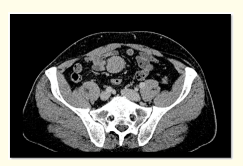
Figure 1: Solid tumor, with oval morphology and smooth margins, measuring 3,7x3 cm; the tumor contacts with the ileum and do not have fat plane of separation.

Under general anaesthesia, we perform a laparoscopic approach with four trocars (a 10 mm optic trocar using the open technique in the belly button, two 5 mm trocar placed in the left lower quadrant and epigastric region, and a 12 mm trocar in the left lower quadrant, all placed under direct vision. General inspection of the peritoneal cavity was normal without adherence. The tumor was located in the ileum at 1,50 cm from the ileocecal valve. We perform a small bowel resection included the tumor with a lateral-to-lateral intracorporeal anastomosis and closed the enterotomy with simple 3/0 absorbable monofilament stitches (Figure 2,3). To exteriorize the small bowel we use a bag and enlarge the incision of the navel trocar. The histopathology report showed a intestinal Leiomyoma with margins free of tumor and mitosis was < 1 per 10 high power fields. Postoperative recovery was without complications, the oral intake was commenced on the second postoperative day and was discharged from hospital on the third day after surgery.