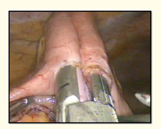
Figure 2: Lateral-to-lateral anastomosis with stapler.

Under general anaesthesia, we perform a laparoscopic approach with four trocars (a 10 mm optic trocar using the open technique in the belly button, two 5 mm trocar placed in the left lower quadrant and epigastric region, and a 12 mm trocar in the left lower quadrant, all placed under direct vision. General inspection of the peritoneal cavity was normal without adherence. The tumor was located in the ileum at 1,50 cm from the ileocecal valve. We perform a small bowel resection included the tumor with a lateral-to-lateral intracorporeal anastomosis and closed the enterotomy with simple 3/0 absorbable monofilament stitches (Figure 2,3). To exteriorize the small bowel we use a bag and enlarge the incision of the navel trocar. The histopathology report showed a intestinal Leiomyoma with margins free of tumor and mitosis was < 1 per 10 high power fields. Postoperative recovery was without complications, the oral intake was commenced on the second postoperative day and was discharged from hospital on the third day after surgery.