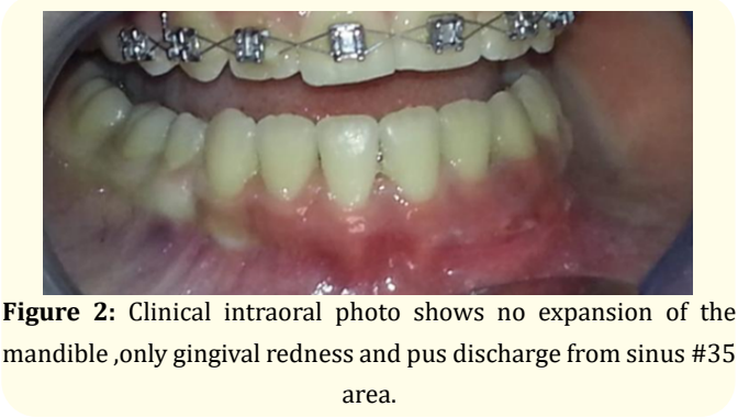
Figure 2: Clinical intraoral photo shows no expansion of the mandible ,only gingival redness and pus discharge from sinus #35 area.