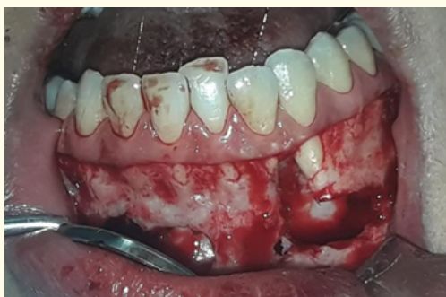
Figure 4: Surgical procedure performed under local anesthesia involved incomplete enucleation, overlying egg shell bone removed with periosteal elevator. Marsupialization done by iodoform packing.