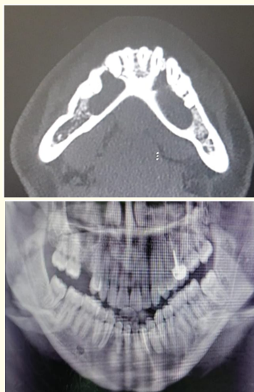
Figure 7: Recurrence of the lesion after 3 years seen in Panoramic x ray and axial section CT scan showing as 2 cysts separated by bony septum. RCT performed for non vital tooth #32.

to the original size of the lesion, accompanied by renewed pus discharge. (Figure 7) In recurrence, vitality testing was conducted for the teeth involved #36 to #46, and concluded that tooth number #32 was not vital, therefore, root canal treatment was done for #32. To exclude any possible trigger for recurrence. Moreover, surgical curettage with peripheral ostectomy using a low speed handpiece surgical bur, and followed by packing with iodoform gauze was performed for marsupialization. Postoperatively, pus discharge reduced significantly, eventually subsiding completely.