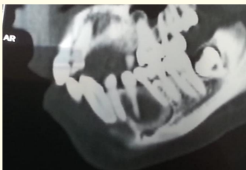
Figure 5: After 4 months follow up lesion significantly reduced in size with evidence of bone regeneration.