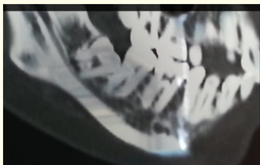
Figure 6: Follow up CT scan after 12 months show almost complete healing of the cystic lesion.

to the original size of the lesion, accompanied by renewed pus discharge. (Figure 7) In recurrence, vitality testing was conducted for the teeth involved #36 to #46, and concluded that tooth number #32 was not vital, therefore, root canal treatment was done for #32. To exclude any possible trigger for recurrence. Moreover, surgical curettage with peripheral ostectomy using a low speed handpiece surgical bur, and followed by packing with iodoform gauze was performed for marsupialization. Postoperatively, pus discharge reduced significantly, eventually subsiding completely.