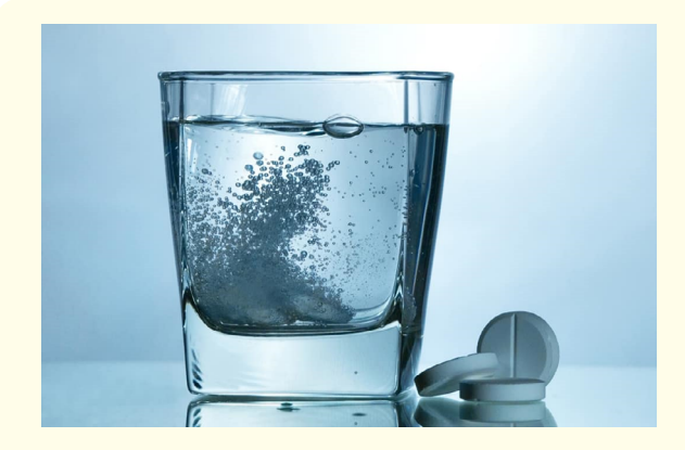
Figure 4: Denture cleaning tab in water.