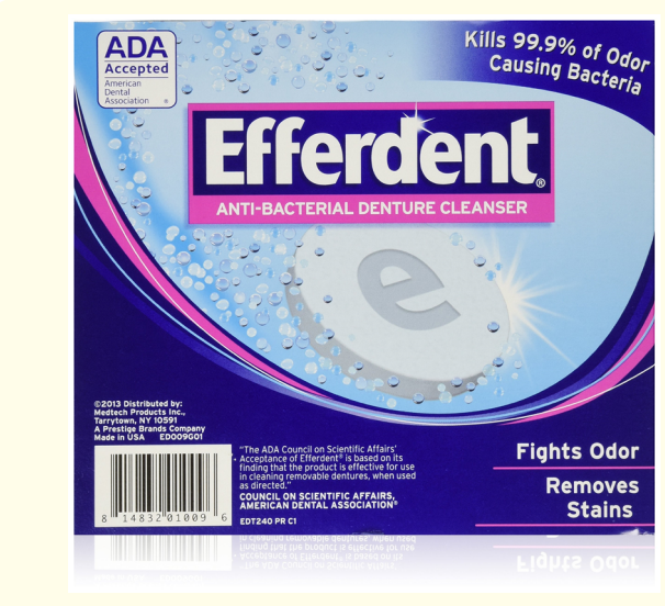
Figure 3: Effervescent denture cleaner.

added because of its detergent action and cleaning. This group of chemicals have limited antimicrobial activity when compared to Sodium hypochlorite. But these can safely be used with metallic components. Effervescent denture cleaners are not recommended with prosthesis with resilient liners because in due course of time, resiliency of the liners get reduced and the liner becomes stiff defeating the very purpose of it. Patients should be cautioned that the effervescent tablets should never be tried in the mouth or swallowed. The manufacturer's instructions should be strictly adhered to. These products are available in India. In some products, enzymes like amylases, lipases and proteases are included which are capable of lysing fats and protein containing organic substances and eliminating candida albicans [25-27] (Figure 3,4).