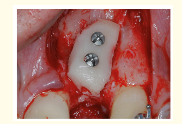
Figure 4: Bone block fixed with screws in order to incorporate it.

The next step was to drill multiple holes in the implant bed in order to facilitate the delivery of nutrients to the graft. The grafting material (particulate or block graft, fixed with screws, mesh or miniplates, or even a combination of these) was added in the region (Figure 4).