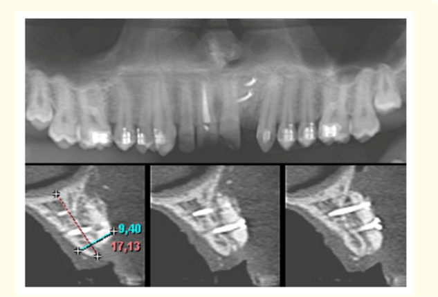
Figure 6: CT scan six months after reconstruction.