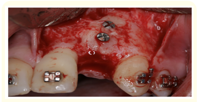
Figure 7: Excellent bone graft incorporation.