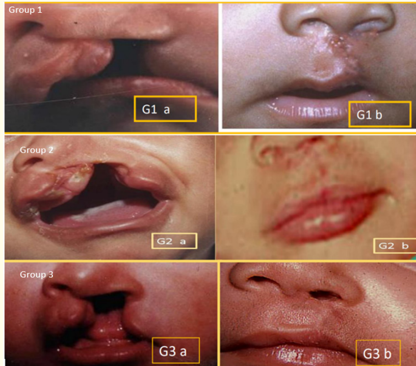
Figure 2: Showing (G1a and b) group 1 preoperative and 14 months post operatively, (G2a and b) group 2 pre and 14 months post operatively, (G3a and b) group 3 pre and 14 months post operatively.

significant difference between groups was noted in the cupid's height and length of columella as shown in fig.2. At 12 months post-operatively, a highly significant increase ( P < 0.01 ) was noted in nostril widths, nostril height, philtrum height and fullness of the lip in (group I) compared to the other groups, while there was no significant difference between groups in the other components (Figure 2).