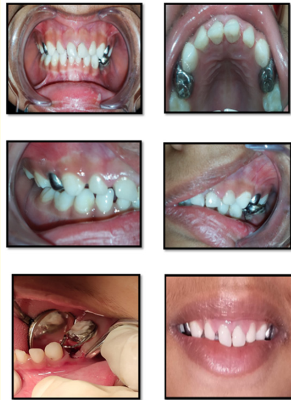
Figure 6: Post-operative view.