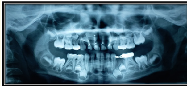
Figure 7: Post-operative view.

tion. The ability to independently maintain ventilatory function is often impaired. Patients often require assistance in maintaining a patent airway, and positive pressure ventilation could also be required due to depressed spontaneous ventilation or drug-induced depression of neuromuscular function. Cardiovascular function may be impaired.”