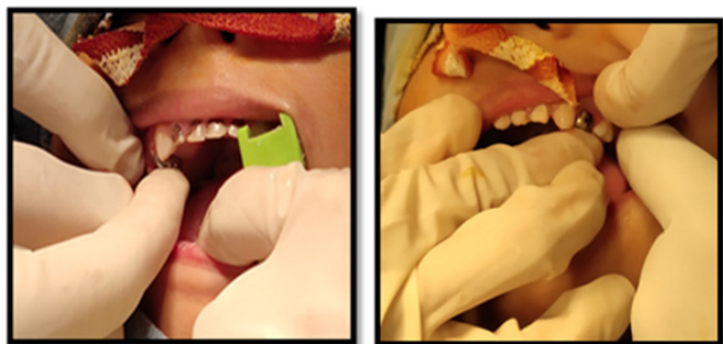
Figure 5: Stainless steel crown irt 54, 64.