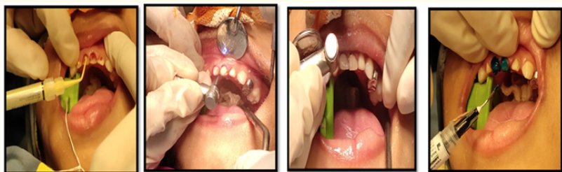
Figure 4: Strip crown irt 51, 52, 61, 62.