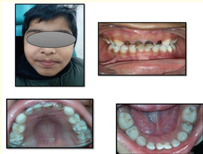
Figure 1: Preoperative view.

After completion of the dental treatments, the patient was transferred to the recovery room, where he recovered uneventfully from the general anesthesia. All dental procedures were completed without any problems, and the dental procedure was completed in 90 minutes. After an oral examination, he was discharged from the hospital the next day.