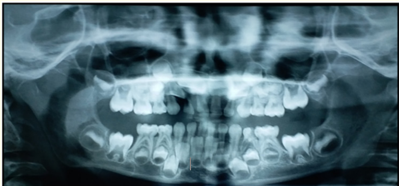
Figure 2: Pre-operative OPG