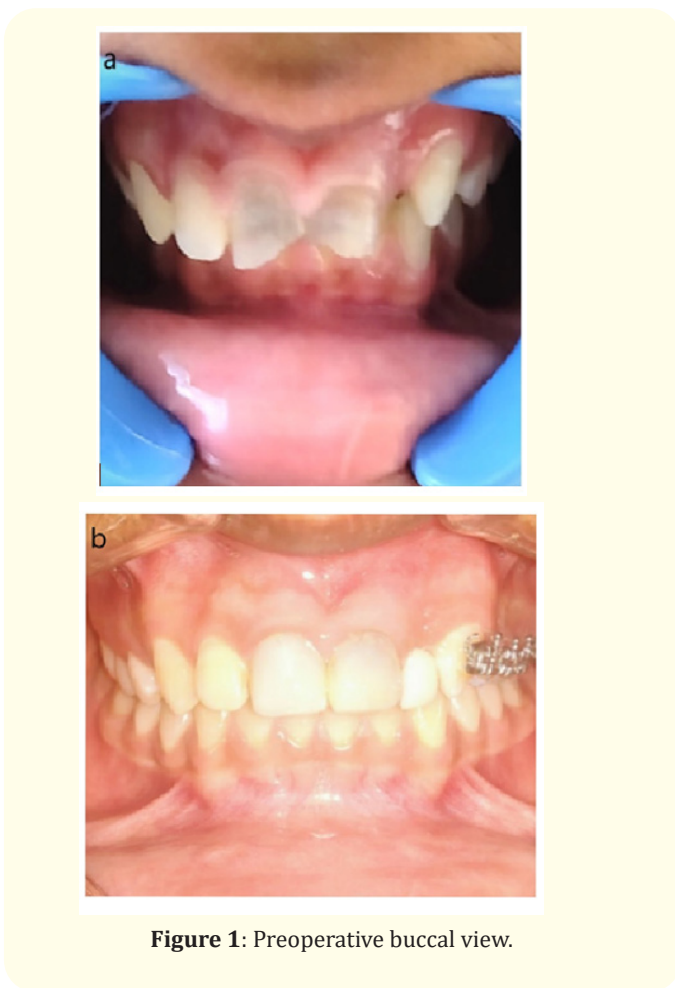
Figure 1: Preoperative buccal view.

The case history records revealed no significant family, medical, drug or allergic conditions. The clinical and radiographic examination recorded the following findings -Ellis Class III fracture with Chronic Alveolar Abscess, failed root canal treatment and open apices-11, 21, Grade I mobility-21, congenitally absent-22 (Figure 1a,b). The radiograph was taken using the long cone parallel technique using 24 × 40mm size film (Kodak Ultraspeed size II Dental Film, Eastman Kodak), parallel to the long axis of the tooth and perpendicular to the X-ray central cone.