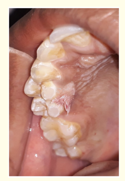
Figure 1: Pre-operative view.

10\times magnification under H & E staining. A two week follow up was performed.