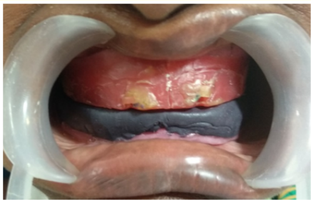
Figure 3: Recording the neutral zone with admix.