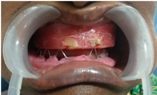
Figure 2: Vertical Stop.