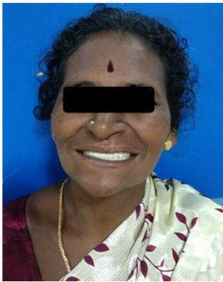
Figure 8: Post Operative.