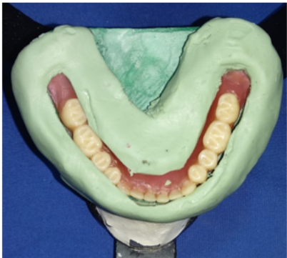
Figure 6: Teeth arrangement in Neutral Zone.