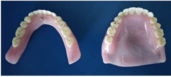
Figure 7: Finished denture with tongue positioning ball.