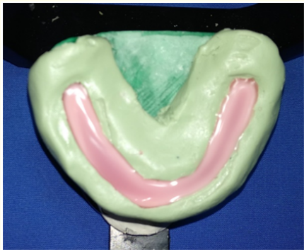
Figure 5: Index of the Neutral Zone.