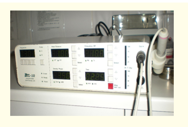
Figure 1: BTL 10.