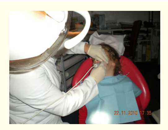
Figure 3: Pain Control for LA using LLLT.