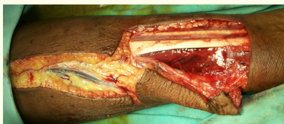
Figure 2: Radial forearm free flap.