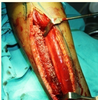
Figure 1: Fibula flap.

couplers (n=2 in group I) and micro vascular staple clips (n=1 in group I) were used. In patients with free fibula flap, the fibula flap was harvested from the donor site via lateral approach (Figure 1). For all the patients right fibula was harvested. For patients with radial forearm free flap (Figure 2), one flap was harvested from left arm and one flap from right arm. All the vessels were anastomosed in an end to end manner for arterial anastomosis while for veins end-to-end or end-to-side for single (Figure 3) as well as dual anastomosis (Figure 4). Intra operative confirmation was done for patency of the anastomosed vessel, leakage, tissue perfusion and both surgical sites were sutured, drains placed and dressing done. Post operatively the viability of the grafted site was checked using Doppler and bone scan wherever hard tissue graft was placed.