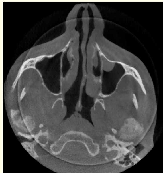
Figure 2: AAxial section of CBCT showing deformed condylar processes of mandible.