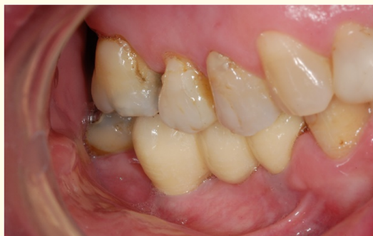
Figure 3: Definitive dental prosthesis.