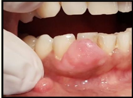
Figure 8: Pyogenic granuloma.

factos.5 Histologically it shows great vascular proliferation lined by thick endothelial cells with epithelium ranging from being hyperplastic to thin or even ulcerated.