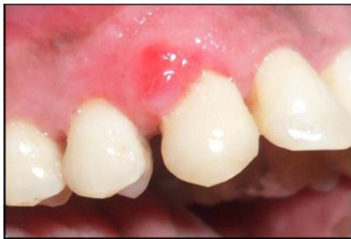
Figure 10: Pyogenic Granuloma (case-2).