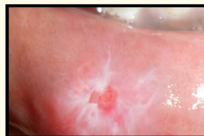
Figure 2: Post-operative.