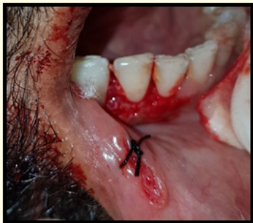
Figure 9: Post-operative.