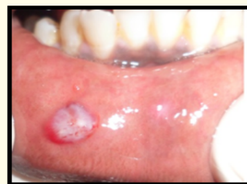
Figure 1: Mucocele.

Mucocele (Figure 1) is a non-cancerous slow growing bluish or translucent swelling which can occur as a result of disruption or blockage of a minor salivary gland duct followed by extravasation and collection of mucins in the connective tissue [1]. A local trauma is the most common etiology, but certain cases present with an unknown etiology. It occurs most commonly in the inner aspect of lower lip but can also occur in buccal mucosa, tongue and floor of the mouth, without predilection for gender.