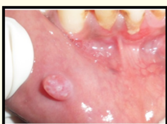
Figure 3: Fibroma.

Fibromas (Figure 3) are slow growing asymptomatic benign tumor of connective tissue origin occurring most frequently in buccal mucosa with predilection for occurrence in females. Histologically it is characterized by proliferation of fibroblast and abundant deposition of collagen fibers [1]. Oral fibromas usually result from chronic irritation such as cheek or lip biting, and chronic irritation by ill-fitting dentures [2]. Oral fibromas are mostly firm and nodular but can be soft and vascular. It is lighter in color than the surrounding tissues because of reduced vascularity [3]. It has another variant called as peripheral ossifying fibromas.