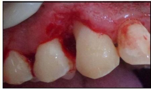
Figure 11: Post-operative.