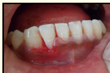
Figure 6: Post-operative.