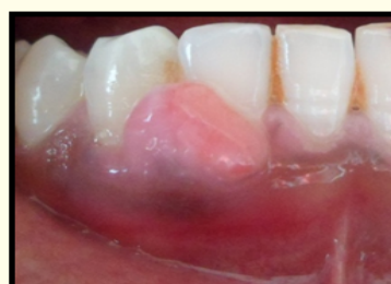
Figure 5: Peripheral ossifying Fibroma.

eration of mature fibrous connective tissue. Radiographic appearance includes presence of calcifications scattered in the central area of the lesion. It usually does not involve the underlying bone, but superficial erosion may be seen in some cases [6]. The condition is believed to be arising from periodontal ligament. Diagnosis is confirmed by histopathological examination (Figure 7).