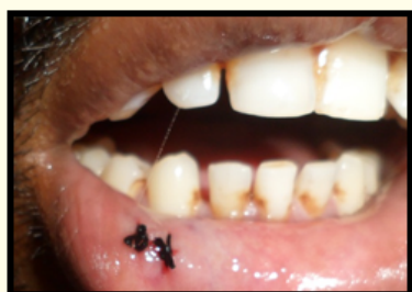
Figure 4: Post-operative.