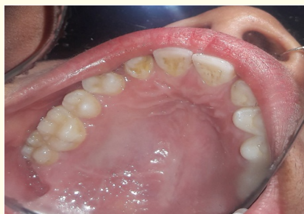
Figure 4: Postoperative view.