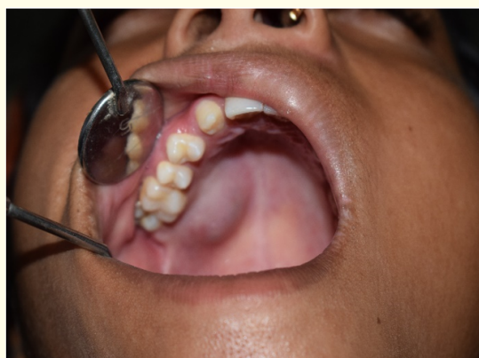
Figure 1: Preoperative Clinical view.

A 14 years old female patient came to our dental outpatient department with complain of swelling over the right side of palate. Clinically, a solitary swelling on the right side of the posterior palate was seen abutting the marginal gingiva in relation to premolars and molars anterior-posteriorly and lateral to the midpalate raphe. The size of lesion was around 4 x 2 cm. The swelling was oval in shape having well defined borders. The overlying mucosa was normal. The swelling was slight tender, soft and compressible. There was no previous history of dental pain and adjacent teeth were vital without caries (Figure 1).