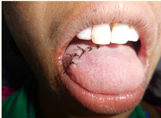
Figure 3: Closure achieved.