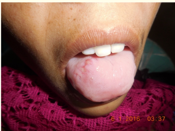
Figure 4: Post-operative follow up 1 month later.