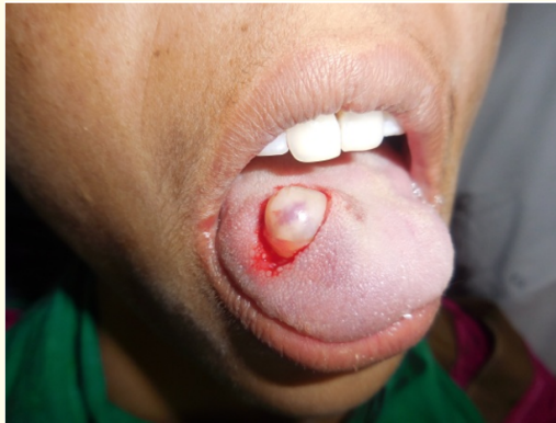
Figure 2: Tumour mass exposed via an elliptical incision over the swelling.