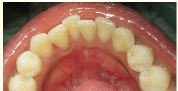
Figure 7: 1 week post-surgery a) buccal view b) lingual view.