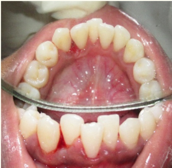
Figure 4: After surgical excision.