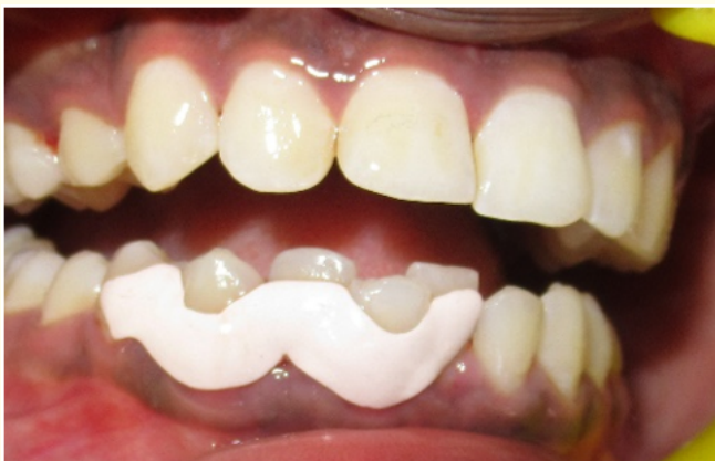
Figure 5: Periodontal dressing.