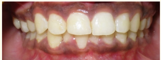
Figure 8: 4 months post-surgery.