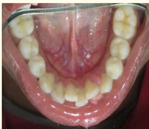
Figure 1: Pre-operative presentation of growth - a) buccal view and b) lingual view.