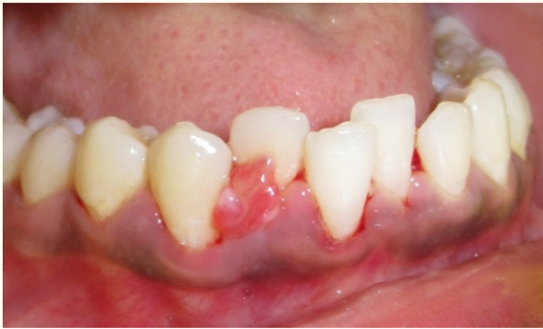
Figure 3: After Phase I therapy.