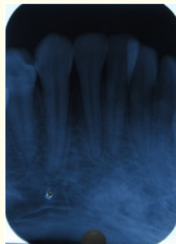
Figure 2: IOPA.

Hyperplastic fibroma, peripheral giant cell granuloma, peripheral ossifying fibroma, pyogenic granuloma was considered in differential diagnosis. Due to the presence of local factors, crowding of teeth, no significant bone loss or calcifications, the clinical appearance and the site of the lesion, a final diagnosis of irritational fibroma was considered.