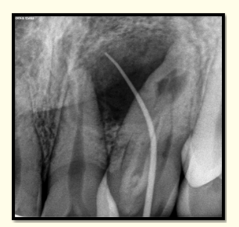
Figure 4: Periapical radiograph of tooth showing the sinus tracing with gutta percha and invagination extending till the middle third of the root canal. Note the periapical translucency.

Canals were negotiated with small size k-files (Mani, Inc; Tochigi, Japan). The invaginated canal was debrided thoroughly and prepared using the step-back technique to apical size 40 and mesial and distal root canals to size 25 under abundant irrigation (Figure 6) with 3% sodium hypochlorite solution and EDTA (Glyde, Maillefer, Dentsply, Ballaigues, Switzerland). The root canals were dried with paper points (Maillefer, Dentsply, Ballaigues, Switzerland) and obturated (Figure 7) with thermoplastic gutta percha (Calamus dual, Maillefer, Dentsply, Ballaigues, Switzerland) and AH+ sealer (Maillefer, Dentsply, Ballaigues, Switzerland). The final restoration of the tooth was completed using composite. The follow-up 3 month radiograph shows periapical healing, and the patient has remained asymptomatic.