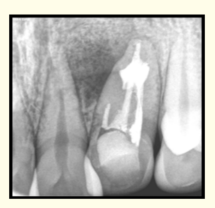
Figure 8: 3 month recall.