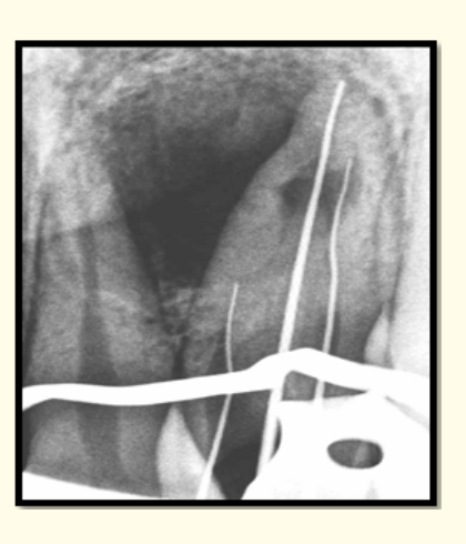
Figure 6: Working length radiograph.

Citation: Ankit Gaur., et al. "Non-Surgical Endodontic Treatment of Oehler's Type II Dens Invaginatus with Dens Evaginatus in a Maxillary Lateral Incisor: A Case Report". Acta Scientific Dental Sciences 2.8 (2018): 121-125