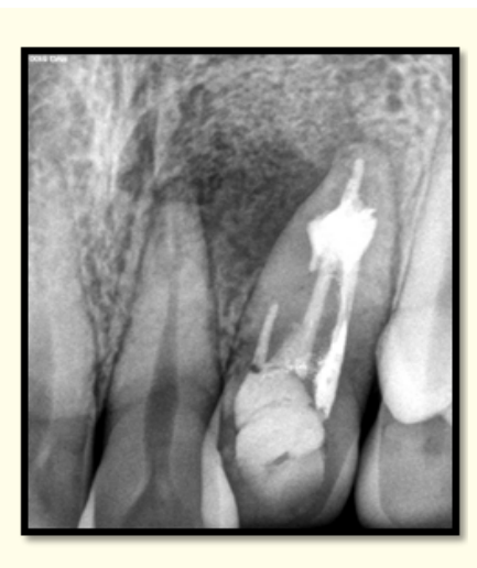
Figure 7: Obturation radiograph.