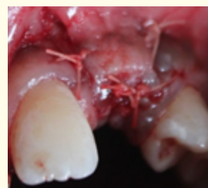
Figure 1g: Suturing