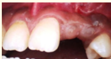
Figure 1a: Preoperative photograph.