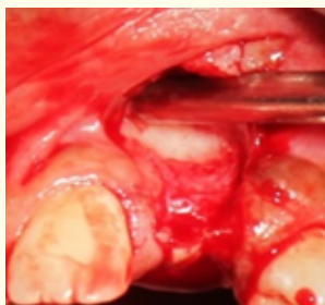
Figure 1c: After flap reflection