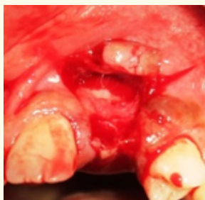
Figure 1d: After decortication.