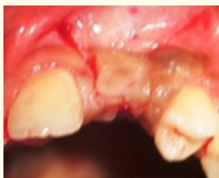
Figure 1b: Incision.