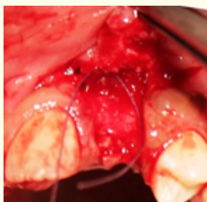
Figure 1e: Bone allograft placed.