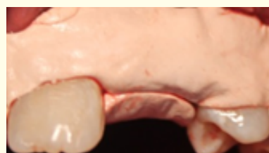
Figure 1h: Coepack placed.