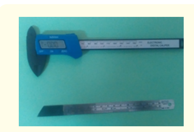
Figure 1: Digital Vernier Caliper.