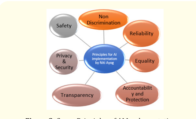
Figure 2: Seven Principles of AI Implementation.