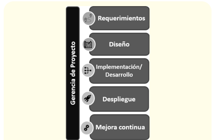
Figure 2: BI Systems Implementation Process summarized. Own elaboration.

The process of implementing business intelligence tools could be summarized below.