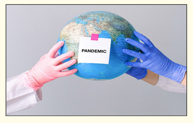
Figure 1: Pandemic preparedness in the globe [3].

Industry 5.0 is a human-centric industrial revolution aiming to leverage human experts' creativity in collaboration with efficient, intelligent and accurate machines within a human-cyber-physical system (HCPS). Several advanced technologies are used to enable Industry 5.0, including sensing technologies, the Internet of Things (IoT), 5G technologies, blockchain, digital twins (DT), collaborative robots (cobots), big data analytics, AI, and cloud/edge computing [4,5]. These technologies play an essential role in developing the emerging innovative concept known as Healthcare 5.0 as a dimension of Industry 5.0 (see Figure 2) [6]. However, building smart pandemic preparedness based on Healthcare 5.0 technologies is still at an early stage. Many challenges still exist to designing end-to-end pandemic preparedness systems to combat the future pandemic, including data interoperability, authentication, privacy, centralisation scalability and robustness. For example, the privacy problem relates to patient privacy protection and data sharing with hospitals and researchers.