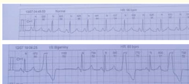
Figure 4: ECG Holter, normal sinus rhythm with few PVCs (bigeminy).