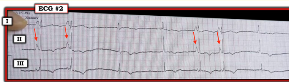
Figure 2: (ECG 2): Sinus rhythm (red arrows) with sinus pauses and junctional escape rhythm.