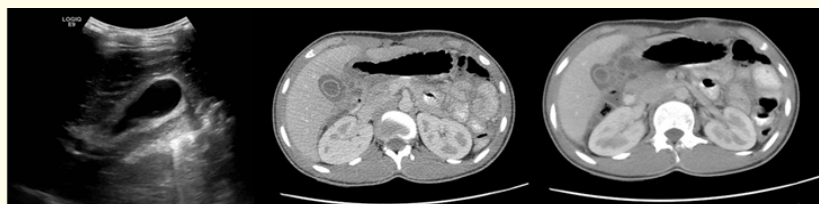
Figure 3: US and CT scan showing thickening of the gallbladder and fluid.

During surgery, multiple peritoneal implants were found scattered throughout the peritoneal cavity (Figure 4), as well as ascites. Several biopsies and microbiological samples were taken.