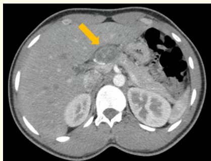
Figure 1: CT scan showing abnormal abdominal lesion.

In light of these findings, the evaluation was complemented with an upper endoscopy, which was clean, and also an echo-en-