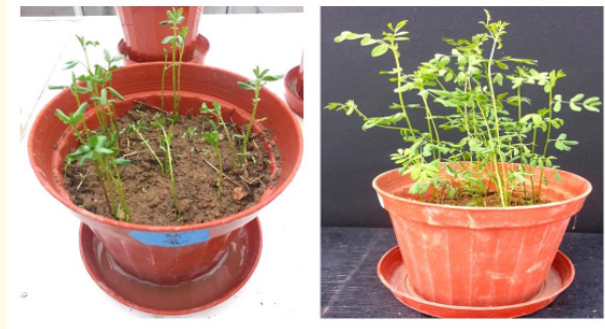
Figure 1: Images of lentil plants grown in the greenhouse; the left figure is the image of the plants germinating in the 1 st week following the seed sowing; the right image is the images of the developing plants in the 1 st month.

There was no contamination found using the sterilizing technique utilized in the research. Embryos at different developmental stages were cultured in MS medium containing kinetin and 2,4-D.